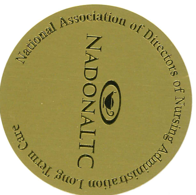
RN, CDP, CADDCT, GDCN™, CDONATM, IP-BC™, FACDONA Master Trainer, Executive Director