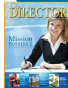
The Director Published Quarterly

Representation on national projects and advocacy for Long Term Care nursing